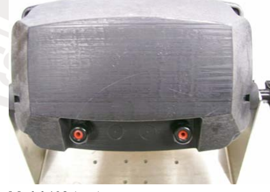
Model 190 (front)