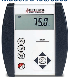
Model 750 indicator with easyto-use, basic weighing functions. BMI calculation, RS232 serial port, and big bold LCD digits.