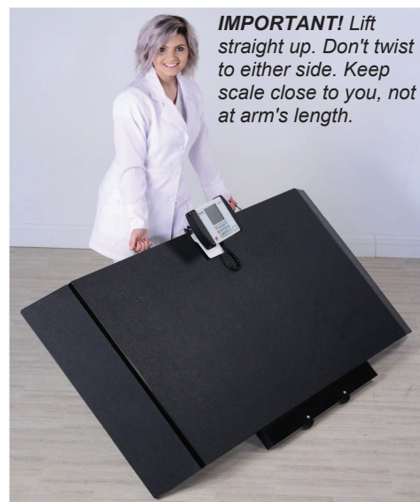
Lifting from or Lowering Scale to Floor (Storage Position)

IMPORTANT! Lift straight up. Don't twist to either side. Keep scale close to you, not at arm's length.