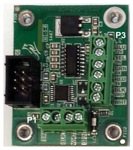
Figure No. 1