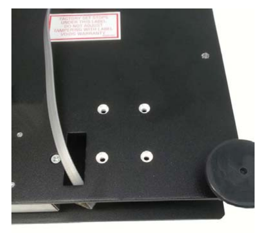
Figure No. 3