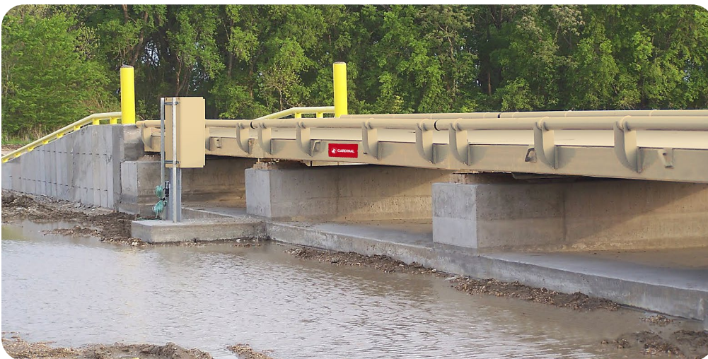
The Guardian truck scale can operate fully submerged underwater. This Guardian installation pictured here functions as a low-water bridge in addition to being a truck scale.