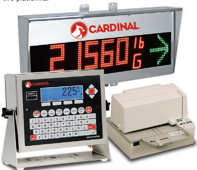
Weight indicators, remote displays, and printers are all available from Cardinal Scale to complete your railcar weighing operation.

Cardinal Scale's LPRA series railroad scales feature a rugged weighbridge with electronic or hydraulic load cell mounting assemblies. The low-profile design eliminates the expense and maintenance of a deep pit. Removing the need for excavation of a deep pit and additional concrete work means construction costs are lower and installation time is shorter. Cardinal's LPRA series can weigh a wide range of rail car sizes. Twenty-five foot approaches are required on each end of the scale, along with an intermediate section in between the two platforms.