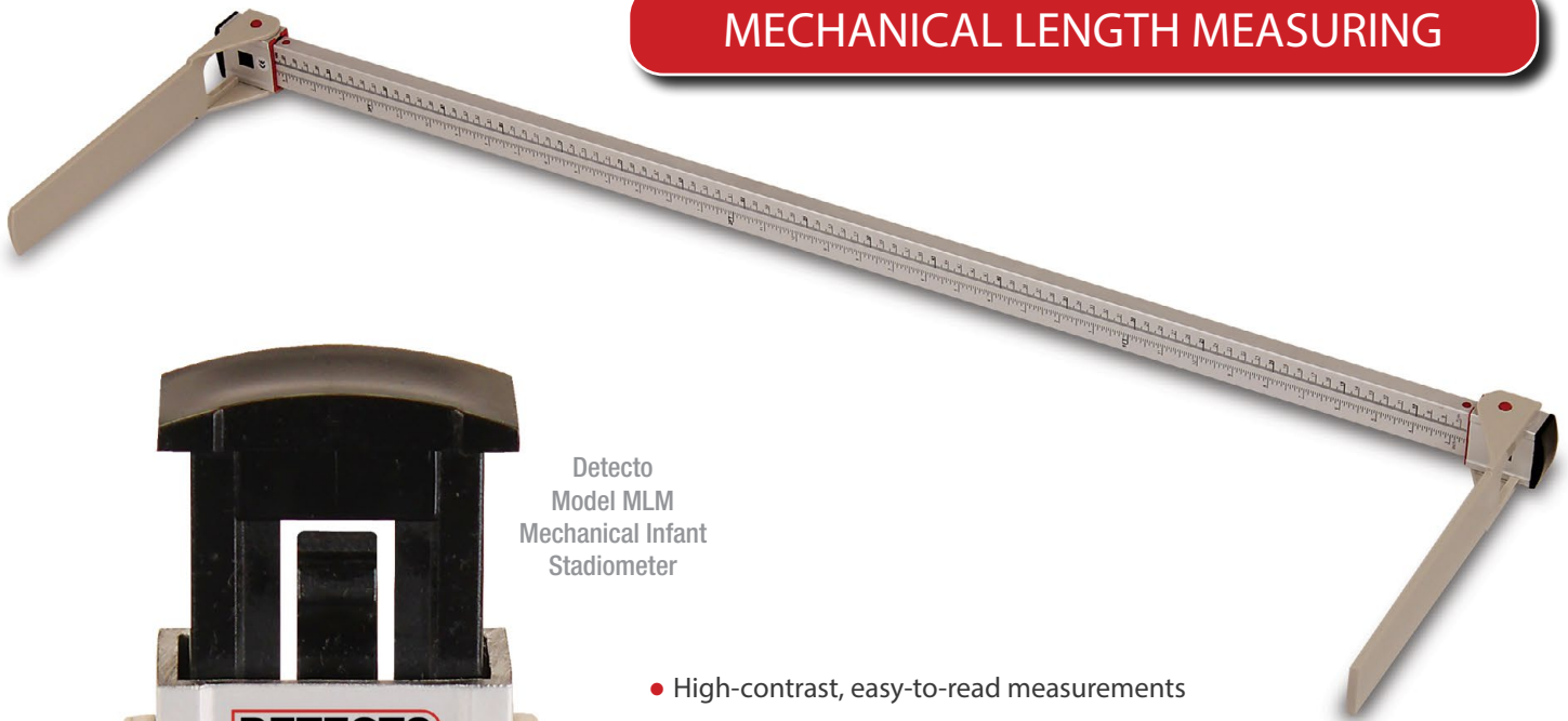
Detecto Model MLM Mechanical Infant Stadiometer