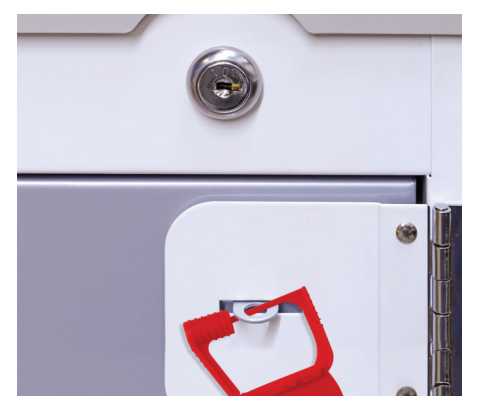
Individual drawer locks and universal keyed lock for all drawers. Optional CAPS red plastic seals are available that come in qty. 50, individually numbered.