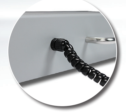
Coiled Load Cell Cable provides 15 ft. extension for connection to indicator.