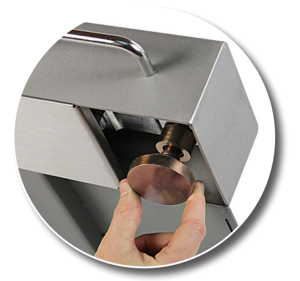
Stainless Steel Load Cells feature self-aligning swivel feet.