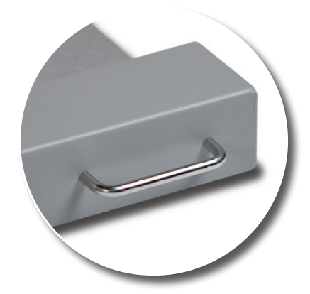
Carrying Handles help efficiently guide the mobile scale during transport.