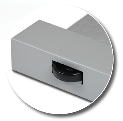
Integral Wheels allow you to easily lift and roll the scale to your next location.

Run-a-Weigh Portable Floor Scale rolls to any part of a facility and is instantly ready for accurate weighing. The Run-a-Weigh weighs in at less than 100 pounds and features built-in handles and wheels, so it's easy to lift and roll wherever you need it. Whether it's weighing multiple locations at a single facility or the need to take the scale to a special job site, the Run-a-Weigh gives you true portability. The Cardinal weight indicator can be set on the floor for mobile use or mounted on a wall or desk for convenient viewing.