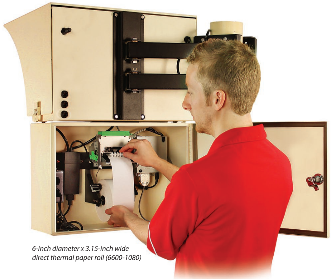
6-inch diameter x 3.15-inch wide direct thermal paper roll (6600-1080)

These unattended weighing terminals allow the driver to remain in their vehicle while weighing which reduces the risk associated with walking across truck scale platforms and traffic lanes. Not only is this a safer method of receiving truck weights, but it also speeds the weighing process for optimal efficiency and reduces overall operating costs.