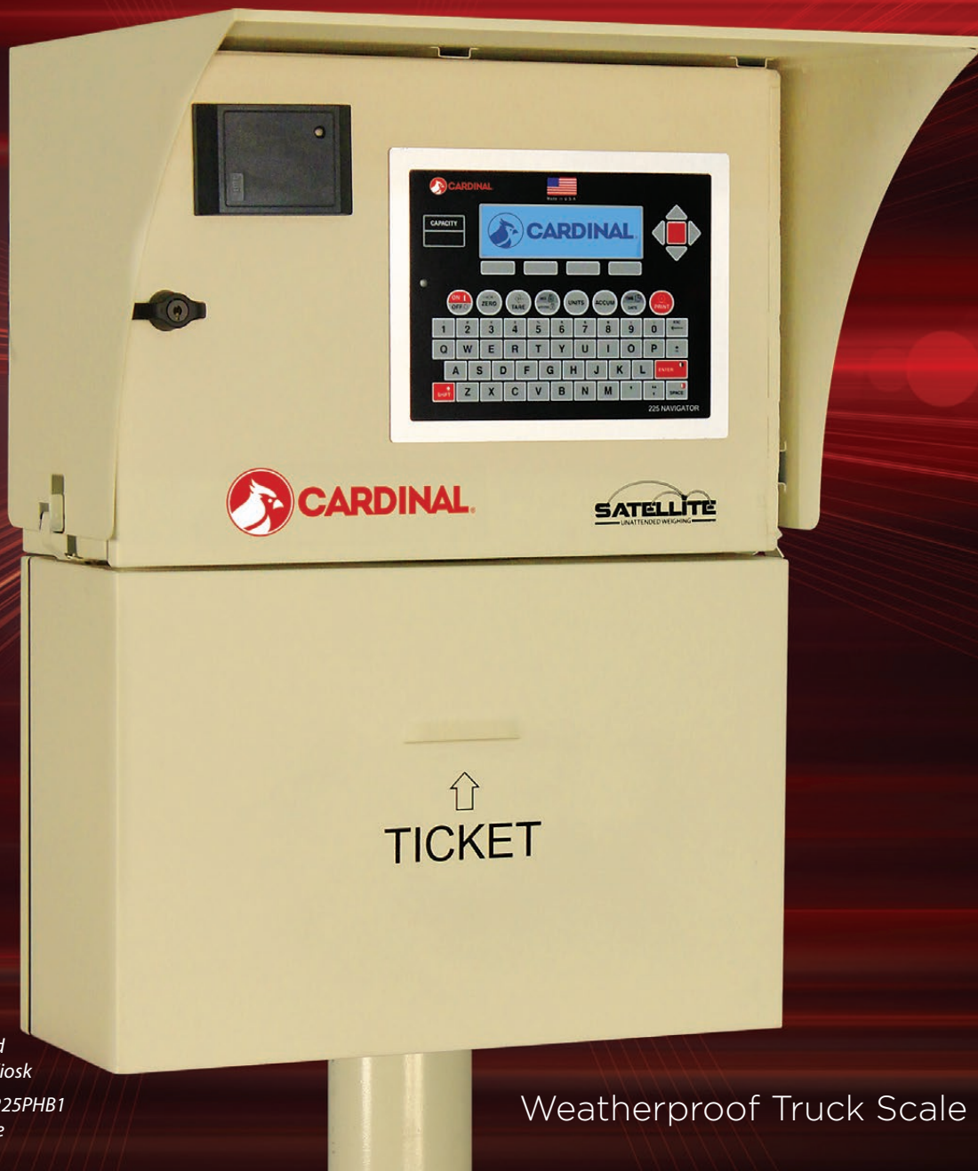
Satellite Unattended Weighing Kiosk Model SAT225PHB1 Shown Here