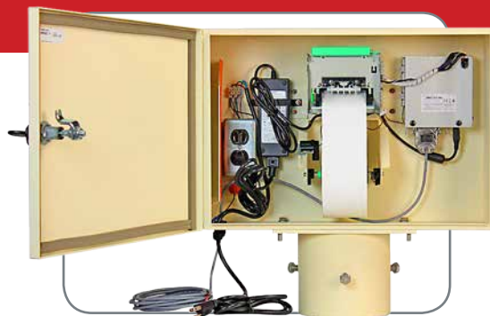
Quick-Access Rear Door