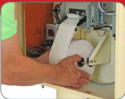
Easy to Refill Paper Rolls