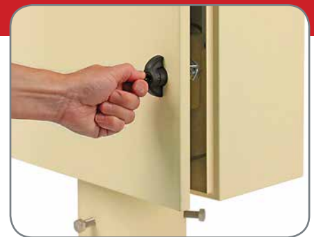
Includes Locking Key

Cardinal Scale's WINENCL-P thermal kiosk printer with steel enclosure provides weatherproof protection for your scale ticket printing. This high-quality, outdoor-grade printing solution accommodates a 6-inch diameter paper roll (included) and features a pole-mounting bracket bolted to the bottom of the printer cabinet, which can be removed for desktop applications.