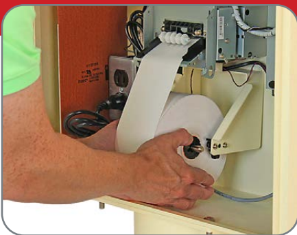
Easy to Refill Paper Rolls