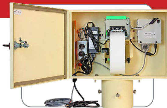
Quick-Access Rear Door