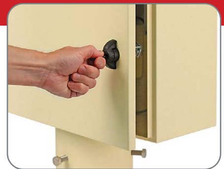
Includes Locking Key

Cardinal Scale's WINENCL-P thermal kiosk printer with steel enclosure provides weatherproof protection for your scale ticket printing. This high-quality, outdoor-grade printing solution accommodates a 6-inch diameter paper roll (included) and features a pole-mounting bracket bolted to the bottom of the printer cabinet, which can be removed for desktop applications.