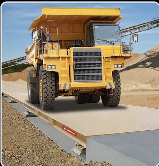
SUPERIOR STEEL STRENGTH FOR HEAVY-DUTY LOADS

The durable baked-on, anti-corrosion powder paint provides a long-lasting quality truck scale appearance for unmatched environmental protection.